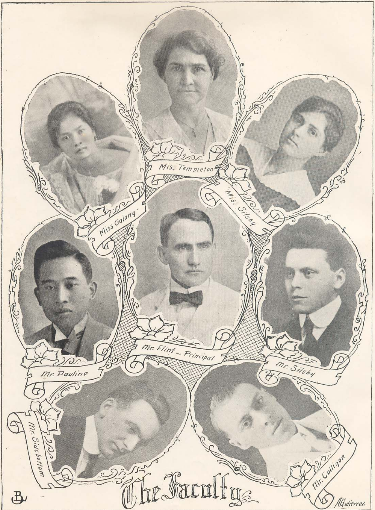
Original Document